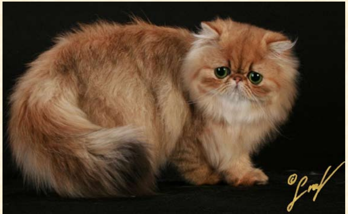
Sunnybeach Goldfever Sire: GC, DW Sunnybeach Don Ciccio Dam: CH Sunnybeach Angel of Mine