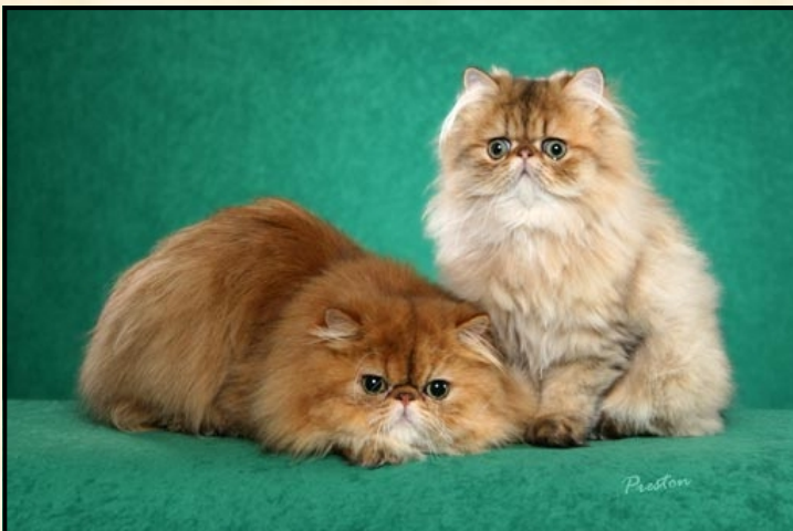
CH Goldkatz Gamblin Man Sire: Ch Silver-Storm Eclipse of GoldKatz Dam: Silver-Storm Uncloudy Day