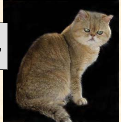
Van IJdoorn Golden Power DOB: July 9, 1998 Sire: Fairisles Surya Dam: Sunset Star van Bommelstein

The warm golden color is something you have to try to keep. Not every kitten has the same warm golden color, but when you keep breeding with the right goldens then it stays with them.