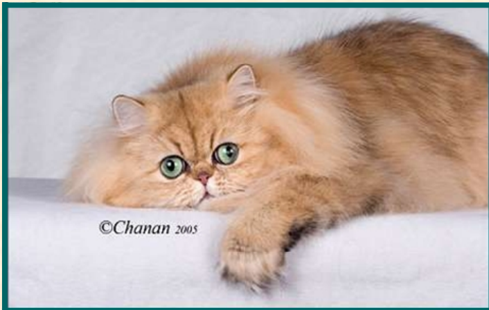
GC, BW, RW Castlegate Bedazzle of Catschateau Sire: GC Castlegate Razzle Dazzle Dam: CH Castlegate's Baby Love

Bottom line...you just have to love the Golden color to pursue such elusive beauty.