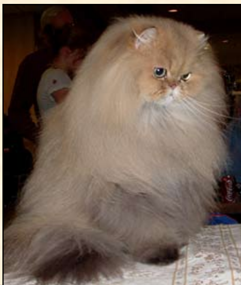
GP Ornamental Mejdán Sire: CH Tootiekats Hot Rod of Ornamental Dam: CH Dalee Golden Magic of Ornamental

The silvers are beautiful to me as well, but "gotta luv them goldens." There is something about the warmth and fire of the golden colors. The other interesting similarity to chestnuts is that I never get two goldens that are "exactly" the same color. I also love how they change in coloring from season to season and year to year. They are truly an ever evolving color.