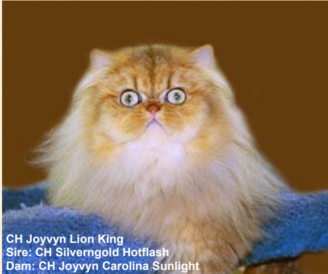
CH Joyvyn Lion King Sire: CH Silvergold Hotflash Dam: CH Joyvyn Carolina Sunlight

All the breeders on the USGF roster who are known to breed Golden (over 30) were asked a few questions, these are the stories of the respondents.