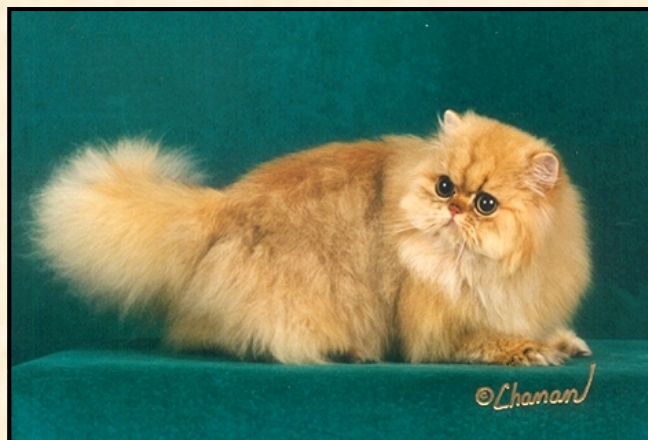
CH Af Edal Loga Supersensual Gold of Salon de Chat Sire: CG Fairisles Superstition Gold Dam: Wenjo's Golden Tamina

I once answered an ad in the newspaper for black and white Persians kittens for sale. The kittens were cute and well cared for, however they just were not what I was looking for. The funny thing was, I didn't know what I was looking for. The breeder was kind enough to give me an old issue of the CFA Almanac to take home. I was hooked the minute I saw an ad for Silver and Golden kittens.