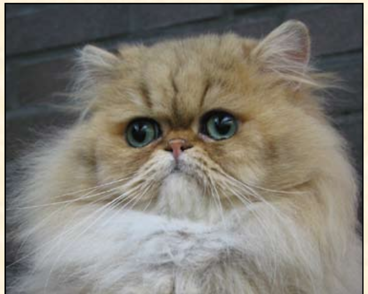
Van IJdoorn Unique Boy Sire: Sunnybeach Fantasy of Van IJdoorn. Dam: Chantilly Lace's Golden Gospel

My most rewarding experience is that I needed to keep a golden male [Van IJdoorn Unique Boy] for my girls. But the only male was not so good. His type and his color was not how I like it. But he was better than nothing. He developed perfectly, but no babies from him. After 3 years I have my first litter from him, 3 kittens. For every year - one kitten. I almost gave up!!