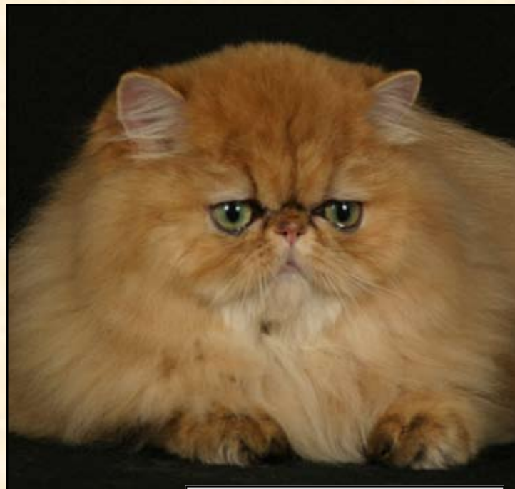
CH Salon de Chat's Queen-Of-Hearts Sire: GC, RW Salon de Chat's George W. Dam: Salon de Chat's Cassie

Showing isn't always about having the winning cat to me. The spectators at our shows seem to get such delight when they discover my Golden Persians. Frequently, mine are the only goldens at the show. Most spectators have never heard of this color and seem to get a great deal of joy in discovering them. I always spend time acquainting them with my cats and let them have a chance to enjoy their personalities. It is very rewarding to introduce these little charmers to the rest of the world.