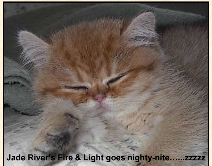
Jade River's Fire & Light goes nighty-nite.....zzzzz