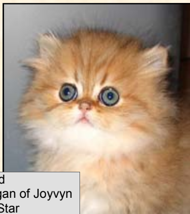
Joyvyn Alphagold Sire:CH Paws&Purrs Brannigan of Joyvyn Dam:Joyvyn AlphaStar