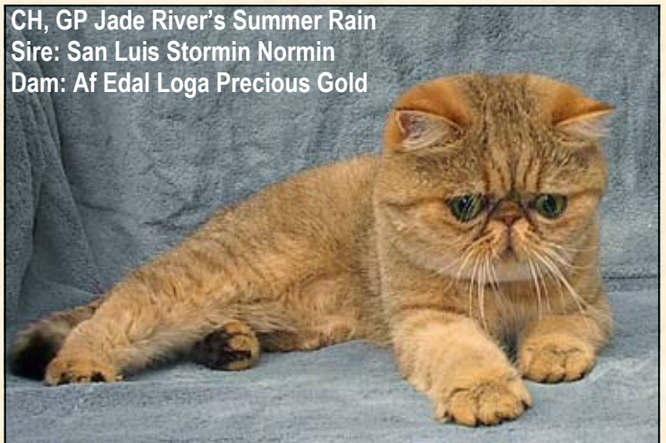
CH, GP Jade River's Summer Rain Sire: San Luis Stormin Normin Dam: Af Edal Loga Precious Gold